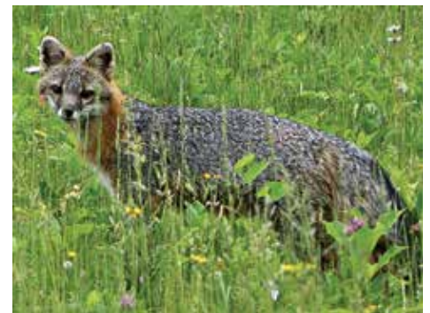
"One warm, summer afternoon I walked over the top of a small hill and to my surprise encountered a beautiful gray fox hunting for field mice. It was so focused on the job at hand it didn't notice me, so I was able to photograph it for several breathtaking minutes before it trotted off."