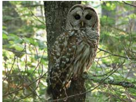
"Many visitors have heard, but not seen, the resident Barred owls calling in the early evening. I was able to have one perch long enough, early one morning, to take its photograph."