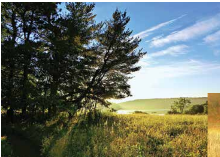
"As an early-morning person, I often visit the Red Trail when the sun is rising. One morning, the combination of sunshine and fog lifting off the field made a spectacular backdrop for a handsome buck munching on his breakfast."