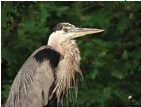
"While watching a chipmunk eat an acorn, I suddenly heard a whoosh of great wings. Looking up I discovered a magnificent Great Blue Heron on a tree limb at the edge of the water."